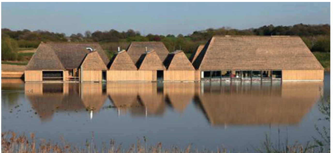
Brockholes Visitor Centre timber-framed oak clad buildings won the Commercial & Public Access Award

the Commercial and Public Access Award. Adam Khan Architects designed the timber-framed oak-clad buildings to be constructed on a concrete pontoon on a lake in the reserve, creating a 'brilliant piece of place making' according to the judges. The Private/Best Small Project Award winner was Strange House in Deptford,