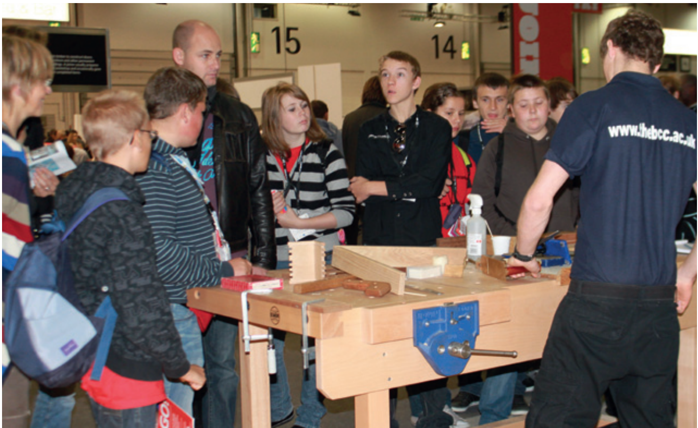
Visitors to the College Stand at Worldskills 2012 watch a cabinet-making demonstration