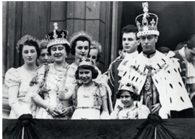
The Coronation of George VI and Queen Elizabeth

hazardous descent into the basement' all the guests seem to have returned safely to the Hall.