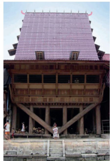
One of the restored traditional houses

traditional houses using the remaining budget from our project in Nias. The work on two houses was finished quickly, but the third house had to be totally re-built which has taken time. Such houses are also used for community occasions and weddings. The third noble house, now over 300 years old is owned by Ama Seni Bu'ulolo, who reports that the 300 Afoa hardwood seedlings we arranged to be planted on his land in 2005 are now eight meters in height.