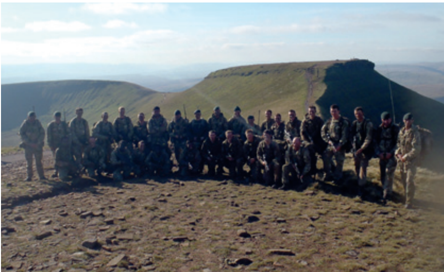
The Junior Non Commissioned Cadre on top of Pen Y Fan (the first time around)

In terms of other we have excelled ourselves and continue to punch well above our weight. For a second year running we have won the inter Brigade festival of sports; this competition is between all the units in the Brigade and consists of a variety of sporting events with the eventual winner is crowned after a particularly gruelling obstacle course race. The highlights this year included strong performances in the Basketball and Football competitions and the worst result was in fact the Hockey where we came 5th out of 12; the fact that the Commanding Officer and the author were playing in that team was purely coincidence though! The end result of the competition was a superb one for the Battalion, with the Commanding Officer being presented with the winning trophy for a second year in a row.