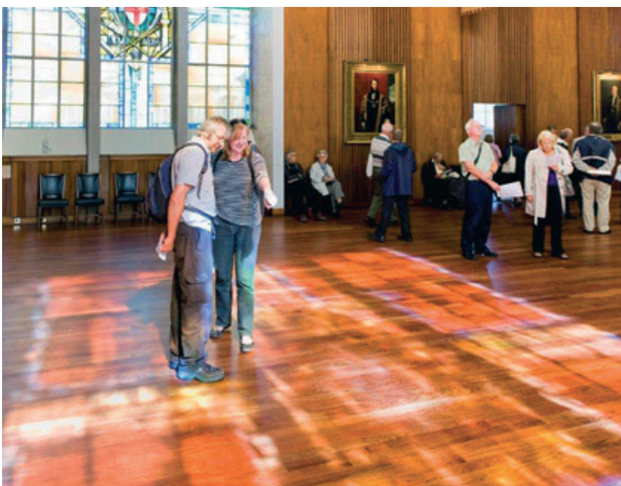
The stained glass in the Hall proved a popular attraction