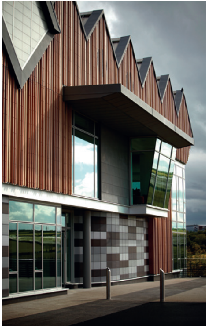
The winner of the Conservation/Restoration category was the refurbished Diamond Hall, Coleraine

For more details, including photographs of all the shortlisted projects, visit www.woodawards.com