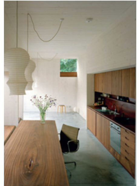
The 75 square metre new-build Strange House in south-east London won the Private/Best Small Project Award

The new Visitor Centre at the Brockholes Wetland & Woodland Nature Reserve in Preston won