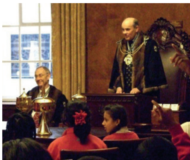
The Master explains the history of the Company to the children of Carpenters Primary School at their party in the Hall in December