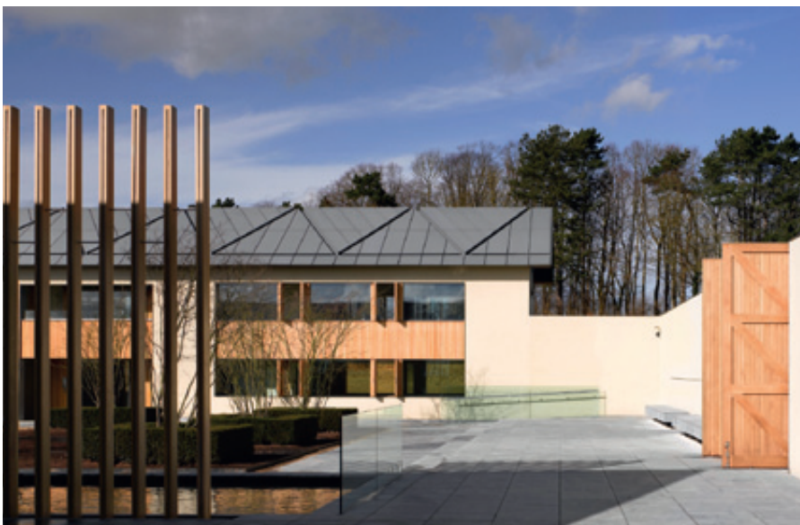
Windmill Hill for the Rothschild Foundation and Archive was the 2012 Gold Award winner

the Commercial and Public Access Award. Adam Khan Architects designed the timber-framed oak-clad buildings to be constructed on a concrete pontoon on a lake in the reserve, creating a 'brilliant piece of place making' according to the judges. The Private/Best Small Project Award winner was Strange House in Deptford,