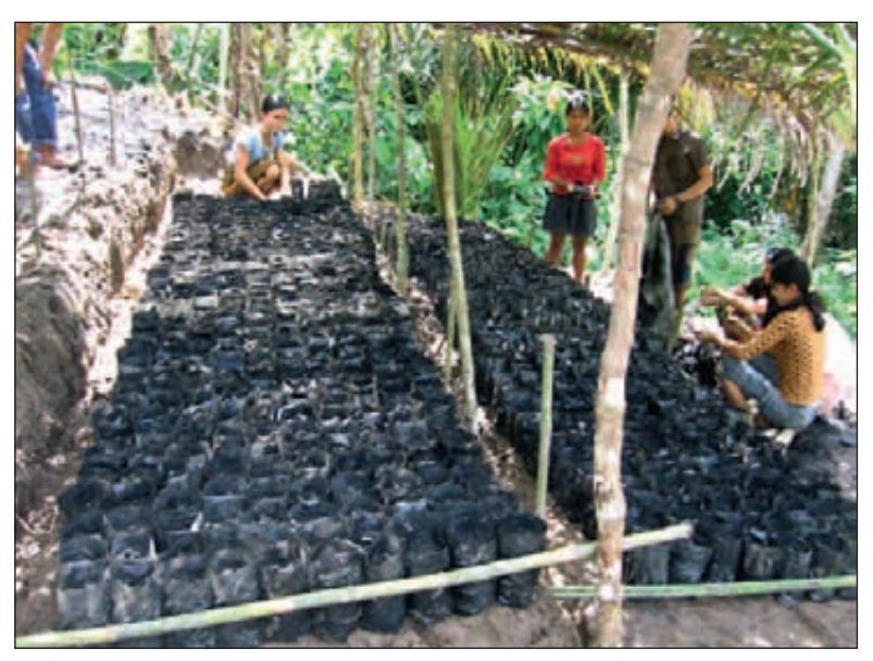
The villagers planting Afoa tree seedlings

The "Great House" of Omo Sebua, already on the World Monument Fund's List of the world's 100 heritage buildings most in need of repair, became the main focus of this project. The fund was able to facilitate much of the immediate work using the local newly trained carpenters. It is hoped that the Turnstone Tsunami Fund project as a whole has focused the attention of several organisations on the importance of this magnificent and almost unique building to ensure its long term maintenance.