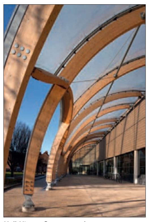
Hull History Centre won the Structural category

The architects Hawkins Brown beat off stiff competition to win the Conservation Restoration Category before being crowned the winner of winners in front of around 200 leading industry figures. Restored to its former glory, Stoke Newington Town Hall consists of two principle spaces, the Council Chamber and the Assembly Hall. Many of the building's original 1930s features have been retained and expertly restored,