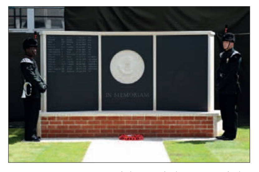
was largely constructed by the Building Crafts College