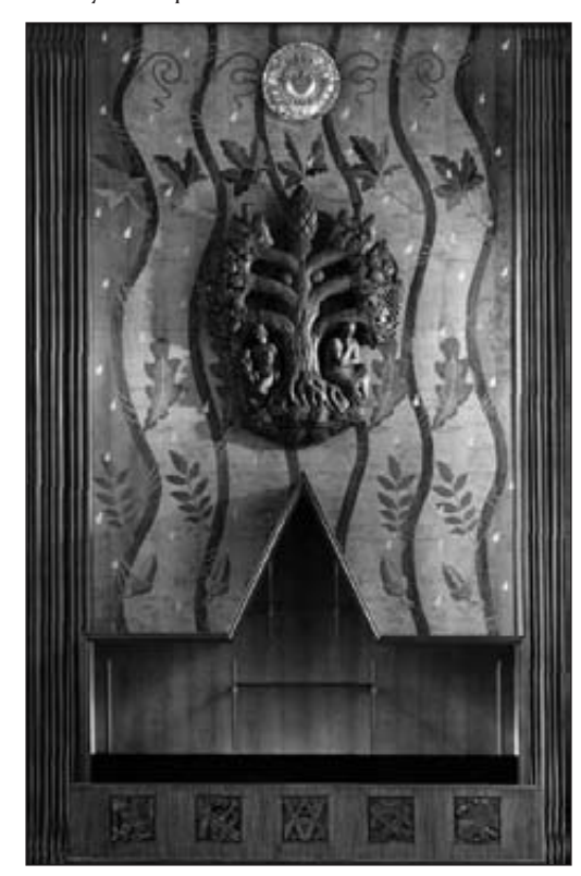
The Tree of Life and display cabinet soon after its completion in 1966

The tree is composed of the figures of a woman and child on the left, and on the right a man, sheltered by the branches of the tree. The branches are loaded with fruit including acorns, apples and grapes, two birds sit on the top branches and a pineapple crowns the trunk. The design of the marquetry background complements the tree, comprising a gilded sun (carved from yellow pine) at the top with raindrops falling across tree trunks, vines and grapes, oak leaves, coniferous leaves and acorns. The background marguetry work is pierced by the display cabinet made from veneered African mahogany, which also contains five panels of Hondura mahogany representing the tools of the carpenter. The coats of arms of the Company and City hang on each side of the Tree of Life and are carved from yellow pine.