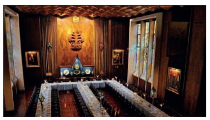
The Tree of Life at the west end of the Hall

Dominating the Company's Banqueting Hall is the massive Tree of Life carved by Sir Charles Wheeler in 1966. Wheeler also designed the variwood marquetry background behind the sculpture and the display case for Company plate. Carved from Burma teak, the tree is approximately 8 feet in height and the marquetry comprises 18 different types of wood including cedar, sycamore, walnut, mahogany and eucalyptus. The Tree of Life was commissioned by the Company in 1965 but it is not clear why Sir Charles Wheeler came to be the chosen artist. Unfortunately no original designs have survived in his papers at the Henry Moore Institute in Leeds or at Carpenters' Hall but some clues are given in the Court minutes.