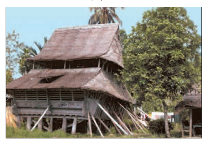
Wood house in Nias after the earthquake struck

fter the great Tsunami in December 2004 and Aearthquake at Easter 2005, Michael Buckley with friend Roger Miall set up the Turnstone Tsunami Fund (TTF) and eventually raised over US$50,000 to assist restoration. Both of us had worked in Southeast Asia over many years so had valuable practical experience and knowledge of the region. Appalled by the tsunami, we offered our help to the Red Cross but received no response, so we set out to make our own contribution to the disaster relief. Initially we raised funds and sent $5,000 for the immediate needs of water, clothing and blankets. We then looked at working with a leading NGO in the field but rejected their insistence on a 47% contribution to overheads, pension funds etc. We insisted on 100% of funds going directly to whatever project we could best assist.